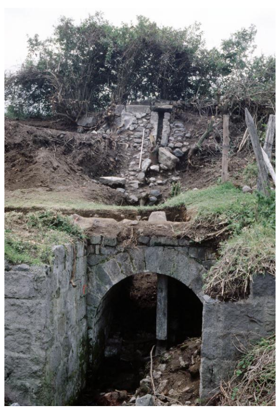
A host of travelers and scientists visited the site during the 19th century, contributing descriptions and occasional drawings of the

the site to private interests. Humboldt wrote a brief description and drew a site plan and sketches of some of the features that are very close to what can be seen today as well as the archaeological evidence. Humboldt was the first to dispel the myth that the Callo hill, a kilometer north of the hacienda, could have been an ancient pyramid. He correctly pointed out that it is a volcanic remnant probably related to the nearby volcano.